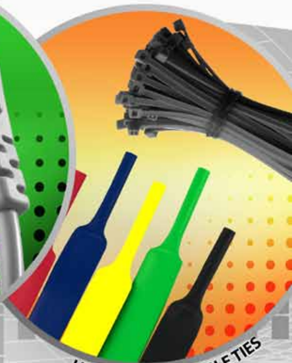
HEAT SHRINK & CABLE TIES