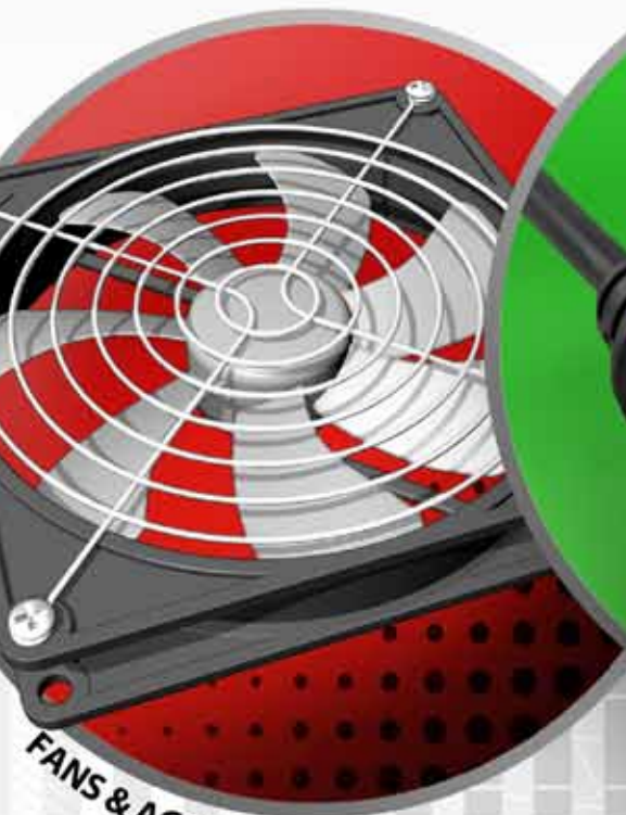
FANS & ACCESSORIES