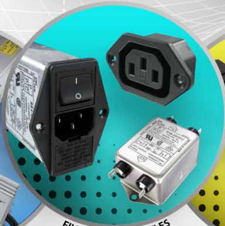
FILTERS & RECEPTACLES